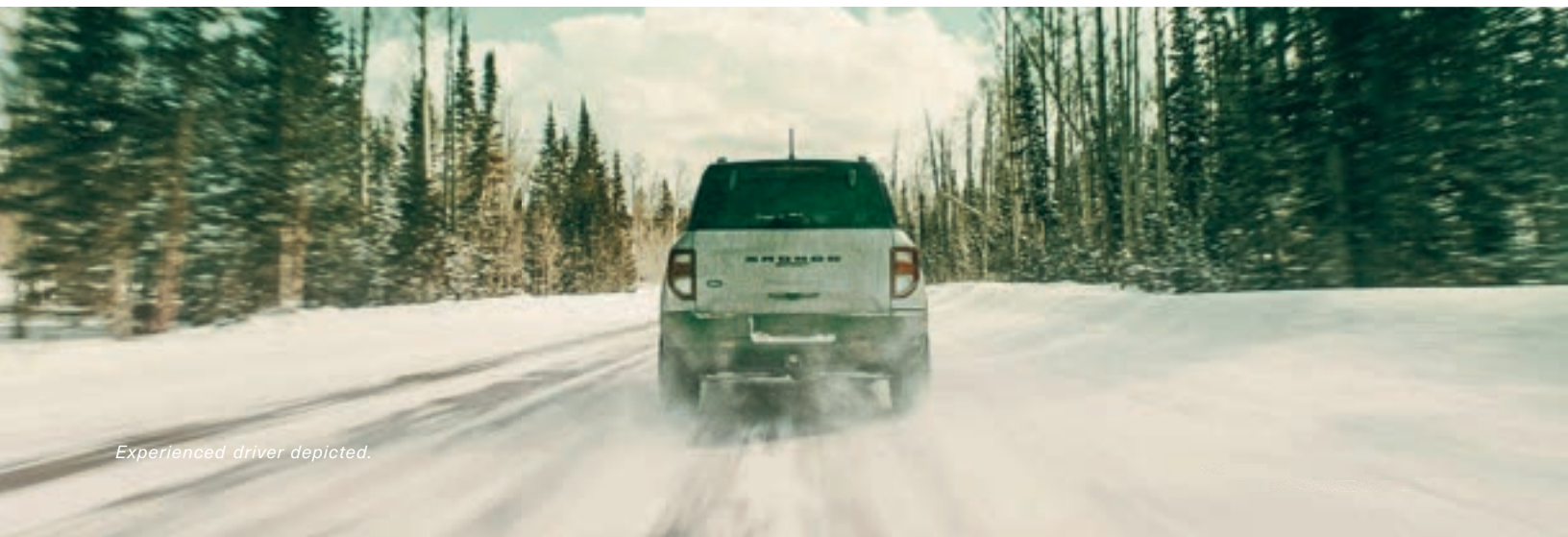
Experienced driver depicted.