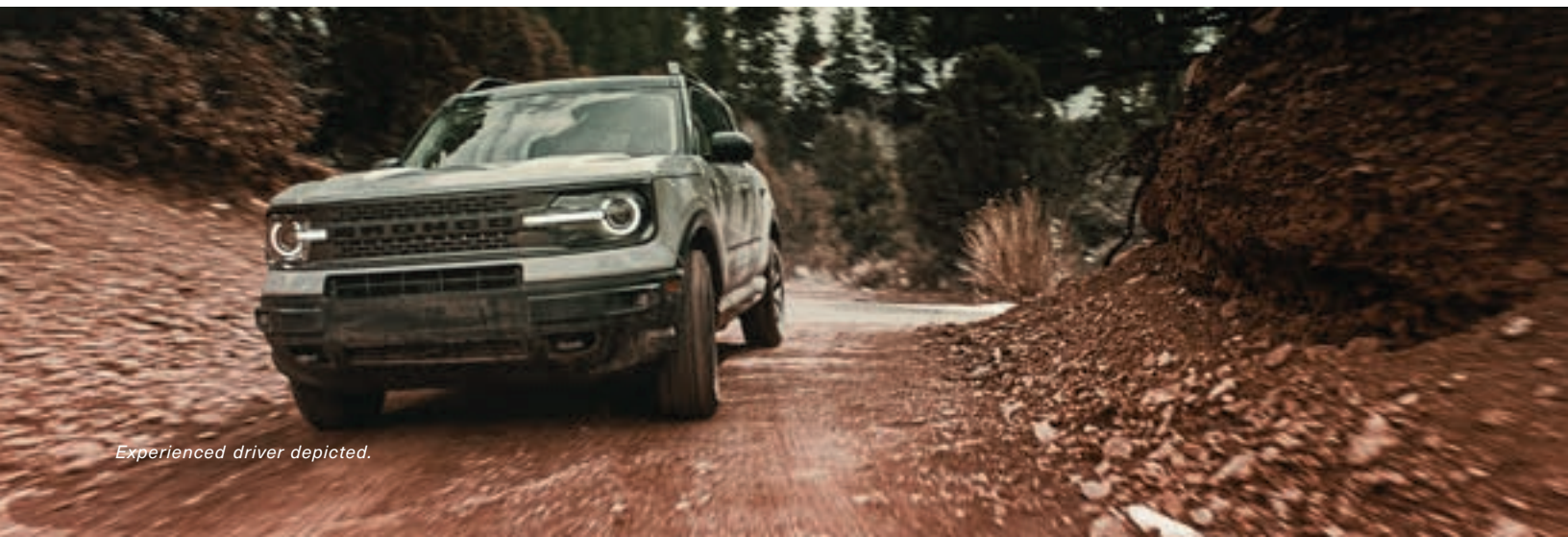
Experienced driver depicted.